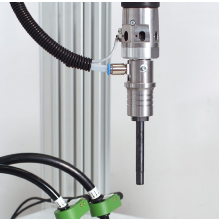
Bit with vacuum device

Suitability for use in a cleanroom must be considered starting with the screwdriving tool. Even insertion of a bit into the screw's drive head can generate undesired abrasive particles. DEPRAG screwdrivers from the series MINIMAT®-EC-Servo reduce speed as the screwdriver makes contact with the bit. Built-in sensors recognize the exact screw position and ensure the correct contact point of the bit with the screw head. Only once contact has been established does the speed increase, thereby minimizing abrasion. Any remaining residual particles are suctioned off by a vacuum device.