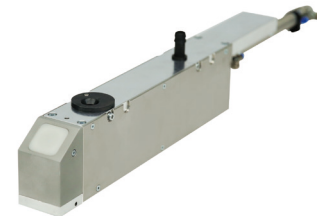
Protective Pick & Place Nest

(800) 433-7724 (800) 4 DEPRAG (972) 221-8731 Local Phone (972) 221-8163 Fax www.depragusa.com