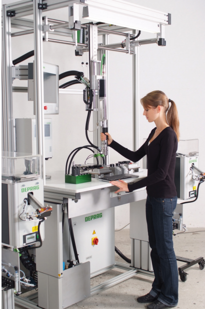
Complete Workstation with HMI, Feeder(s), Controller, Part Fixture

"The collaboration with DEPRAG has been impressive. All our technical requirements were realised with already existing harmonised standard components within the shortest space of time. And what is particularly important for us, all system components come to us from one source. When we need to increase our production capacity we can flexibly expand our assembly line".