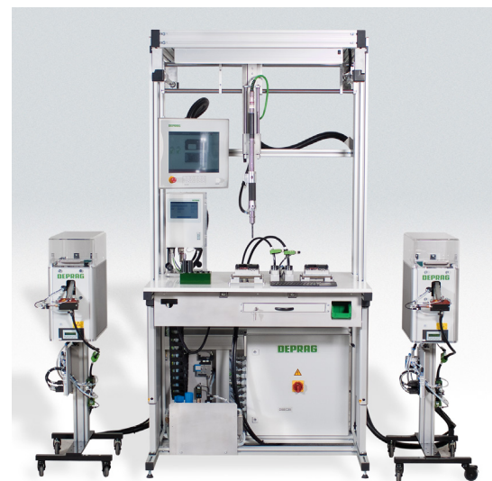
Complete Workstation with automatic Screwfeeding

Using interchangeable adaptors, assembly can be flexibly converted to the various sizes of HCU25, HCU50 and HCU100. Work piece adaptors are equipped with integrated sensor technology and communicate with a superior controller.