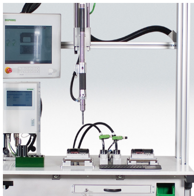
Close-up of Screwdriver on an intelligent Workstation

These high standards of processing reliability and documentation advocate an automatic solution which eliminates the possibility of human error. The required flexibility and adaptation to varied production versions however recommends a flexible operator controlled semi-automatic assembly solution. "There are several options in approaching this assembly task" explains Jürgen Hierold, Sales Manager at DEPRAG SCHULZ GMBH u. CO. "In this instance I would suggest a flexible upgradeable assembly line with intelligent manual work station".