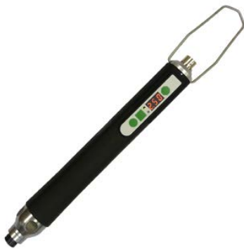
New and improved Minimat-ED

Just like its predecessor the new MINIMAT-ED is reliable, has an extremely long life-span and very high torque precision. Using Plug-and-Play it makes child splay of varied screw assembly. The user connects screwdriver and power unit with the highly flexible tool cable. Screw assembly can then begin straightaway either by pressing the button or push-to-start.