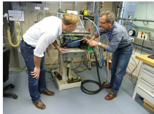
Test facilities Technical University Amberg-Weiden

For gas heating a total of 552,000 kWh was saved. These savings are equivalent to 36 percent of the total heating requirement. The annual average has been able to reuse 52 percent of the compressor power consumption for heating. The peak value of the measurement was 71 percent, which promises innovative developments in compressed air technology and also lowers your energy costs. For example, the pneumatic turbine-drive. Instead of the conventional vane motor it uses a turbine expansion work of the air. This utilizes the working fluids more efficiently, the air requirement of the engine decreases by a third. This scores the turbine drive with an unmatched power-to-weight ratio (kg / kW); it is only half the size of a vane motor. DEPRAG Product Manager Dübbelde, "By replacing a fist-sized vane motor with a turbine-motor of the same size, I can double the power in one swoop!" The turbine also does not require lubricants, and wear parts do not exist. This also speaks to the efficiency of a turbine. Prof. Dr. Eng AP White of the University of Applied Sciences Amberg-Weiden summarizes, "Air is now more efficient than ever if you start to consider using air recovery and there is nothing more economical". For the future, he still sees enormous potential, "Compressed air systems could increasingly find application where the decentralized storage of surplus renewable energy is an advantage. By combining the existing KAESER compressors with the