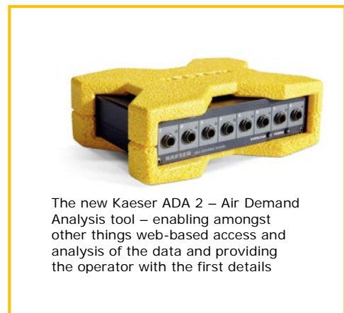
The new Kaeser ADA 2 – Air Demand Analysis tool – enabling amongst other things web-based access and analysis of the data and providing the operator with the first details

Kaeser, is one of the leading manufacturers and suppliers of products and services on the subject of compressed air. The range of know-how includes compressed air, compressed air purification and air distribution. The focus is always on reliability, energy efficiency and cost. Kaeser offers a complete line of air system products including rotary screw compressors with the highly efficient Sigma Profile and the Sigma Control system, Mobilair portable compressors, Omega rotary lobe blowers, vacuum packages, refrigerated and desiccant dryers, filters, condensate management systems and a variety of related products, as well as services such as consulting, planning, analysis and contracting. Kaeser is represented with over 400 employees in more than 100 countries worldwide either by its own subsidiaries or through exclusive partners.