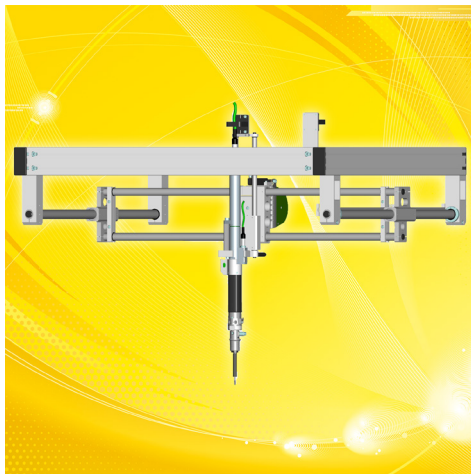
Position Control Portal

The yardstick for processing reliability of bolted connections is particularly stringent in the automotive industry (VDI standard 2862, category A). Every step of the assembly process has to be monitored and recorded. So how is this achieved at a manual workstation? DEPRAG designed a high-quality steel profile position-monitoring portal to ensure that the EC-servo screwdriver is guided into the correct vertical direction. The portal provides a