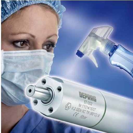
The DEPRAG "Advanced Line" Air-Motors are able to withstand cleaning agents and steam

The air motors of the BASIC line and the ADVANCED line are also ATEX conform i.e. permissible for use in potentially explosive environments. The workings of the air motor mean that it is predestined for use in critical surroundings as the decompression of the air cools any frictional heat created. Therefore the air motor is cool when loaded and overheating and the ignition of gases is impossible. The internal overpressure also prevents the infiltration of harmful dirt and dust.