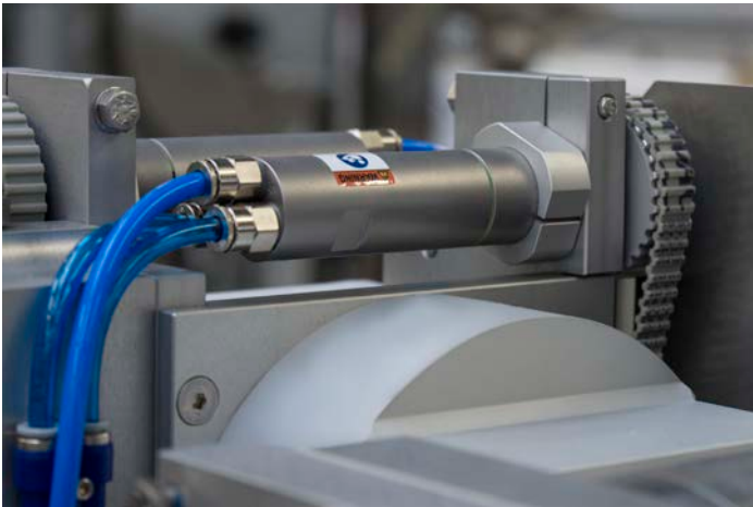
Air motor in a MULTIVAC edge trim macerator

A pneumatic vane motor consists of a rotor which turns inside an offset chamber in the rotor cylinder. The vanes in the rotor are pressed against the wall of the rotor by centrifugal force creating working chambers.