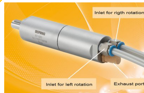
Connecting an Air Motor

In manufacturers' catalogues performance data is based on varied operating pressures . At DEPRAG this is 6 bar. If the application only has 5 bar directly at the motor then the motor loses 23% of its power. If there is only 4 bar available then motor power is reduced by 45%. A differing operating pressure is so decisive that it must be taken into consideration at the start of the design phase using the adjustment table in order to avoid nasty surprises. Next the air supply volume must be ensured which is specified by the air consumption in the manufacturers' details. Every reduction in the width of the opening, whether on the air-supply hose itself or due to connection parts, filters, oilers or also the exhaust hose and silencer, all have a consequence on the air volume. "Therefore I recommend an exhaust air throttle to my customers to regulate their speed", explains Dübbelde. "Using a throttle on the supply air reduces the speed of the motor but at the same time the torque is reduced as well. Exhaust air throttles can reduce the speed without great loss of torque. The exhaust throttle means that my customers can better utilize the wider working range which air motors provide". The optimal life span and performance of an air motor is reached with lubricated use. (1-2 drops of oil per 1 m 3 air consumption). Oilfree operation can lead to a loss of power of around 10-20%.