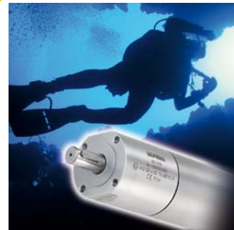
Air Motor for under-water use

The second step examines the motor's construction material. If operating in a dry surrounding environment and in normal stationary production an inexpensive air motor made from cast iron will be sufficient. "DEPRAG offers a wide spectrum of inexpensive BASIC LINE motors. For installation in robots and machines there are a variety of grinding motors, drill-spindles and milling motors available, which are well-known for their low weight and compact size", explains the specialist at DEPRAG. For use in the food industry pneumatic motors must be able to withstand cleaning agents and steam. The DEPRAG ADVANCED LINE motors with external parts made from stainless steel are additionally sealed and lubricated with grease that conforms to food industry standard USDA-H1. Pneumatic drives can even be operated underwater. In this case it is essential to determine the water depth required. If the motors must be started underwater they can be used for a depth up to 5 meters. If the motors are started on the surface and then submerged, they can be used in a depth of up to 20 meters without damaging the motor. If the motor must be sterilizable as requirements demand in some medical technology applications, then the motor can be equipped with special vanes. There are many examples here of why it is important to speak to the air motor manufacturer in advance about your application and to describe it in as much detail as possible.