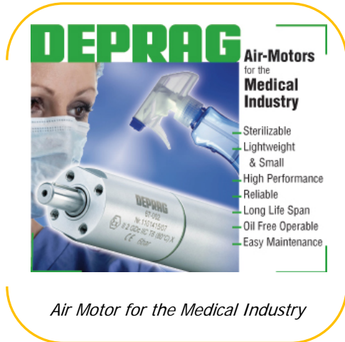
Air Motor for the Medical Industry

If the right motor with the required power has been found, whether stainless steel or cast iron, then the next step is to integrate it into the design. DEPRAG provides various spindle designs and individual mounting methods. A complete solution is often a better value than seeking a gear solution separately. Within the DEPRAG motor range there are numerous air motors with integrated planetary gears, spur gears and worms gears. If you require additional safety in the design then a holding brake can be recommended and our catalog includes complete motor-with-brake packages. For use in potentially explosive environments there are also options with the required ATEX certification. Integration is concluded with the technical verification of the maximum permissible axial and radial load on the drive spindle of the air motor.