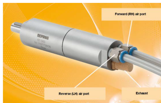
DEPRAG motor port description

Answer: "The air inlet connection which is named R (for right-hand rotation) should be connected to the main air supply. It is important that both the air connection for the left-hand rotation (named L) and the exhaust port remain open or are at maximum covered with a filter. This is the only way for the motor to start without problems and achieve its full power capability".