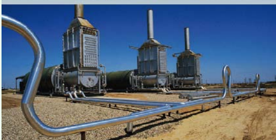
Application example: natural gas pipelines

combine the components rectifier, inverter and ballast circuit in a compact housing. An external load resistor is directly controlled by this unit. If the turbine is not creating power the feed-in converter turns off and does not use any electricity from the supply network. As soon as the turbine generator is generating power again the recovery unit automatically switches turns on.