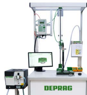
PKS – integrated into a Workstation

The monitor, used for visualization of the process, can be connected via the HDMI on the base stand of the position control stand. The monitor gives the operator exact instructions and shows in color which positions on the product have already been assembled. If the screwdriver mounted on the stand is at the pre-set X-Y coordinate, then this is marked on screen in color and with a text display "OK" or "NOT OK". The lit up status LEDs on the base stand also inform the operator of the current status of the screw assembly.