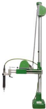
PKS – Precision Control Stand

The "intelligent manual work station" combines manual work with processing reliability which is in no way inferior to automated production. In a well-conceived solution processing reliability is constantly guaranteed despite changing personnel on shift. DEPRAG, the specialists in screwdriving technology and automation have a range of sophisticated standard modules which can be used to design an efficient and ergonomic manual work station. One essential component is the new position control stand.