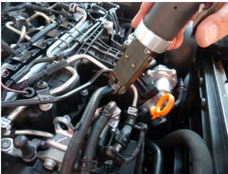
Application Example, Spring Clamps – Effortless installation of a cooling system tube clamp in a vehicle engine compartment