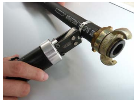
Application Example, Clic Clamps assembled to a pneumatic hose

Countless numbers of assembly jobs are resolved quickly and reliably with the help of pneumatic pliers. There are pliers to fit hoses, to mount chain locks or hollow rivets, to press-fit or set plastic plugs, to set earth terminals, to assemble fuse terminals or hole-reinforcing bushes, to punch or uncouple parts made of rubber, plastic and NE metals, to identify sheet steel, to press in hinge pins, to pre-stretch steel ropes, to spread running rails apart, to expand cable inlets, to apply wide cuts, to bend wire eyes, and there are also pneumatic pliers for stamping holes.