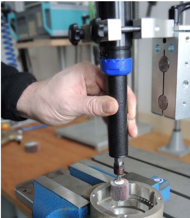
Close-up of a precision deburring station

DEPRAG grinding motors can also be operated without oil."