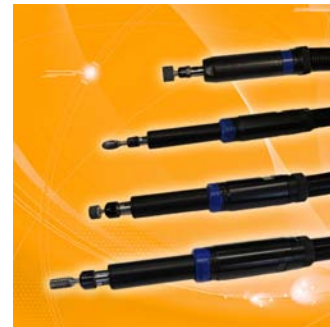
Stationary Grinder for machine integration

Automated processes are coming to the fore in foundries too. The job of cleaning the raw castings; an expensive and time consuming job is increasingly being carried out as part of the automated production process. The practice can also be observed within the synthetics processing and woodworking sectors. It is generally practiced in the manufacturer of high performance products; in large numbers, where process reliability, quality, productivity and the improvement of working environments are an important criteria in the manufacturing process. A major advantage of automation has proved to be its capacity to reproduce high quality in deburring, grinding and polishing processes.