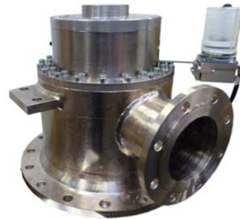
DEPRAG Turbine Generator

Deprag Schulz GmbH u. Co. is one of the market leaders in the manufacturing of air motors. From the development and production of the most varied of air drives over the last decade, turbine technology has become a new focus of the company. Under the registered trade mark "GET", the company offers a decentralized energy recovery solution for a range from 3 kW to 120 kW. The owner managed family company has around 600 employees and is represented in over 50 countries worldwide.