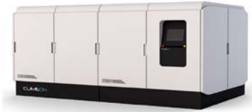
Climeon Ocean 300 kW