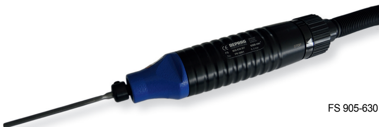
FS 905-630 BY