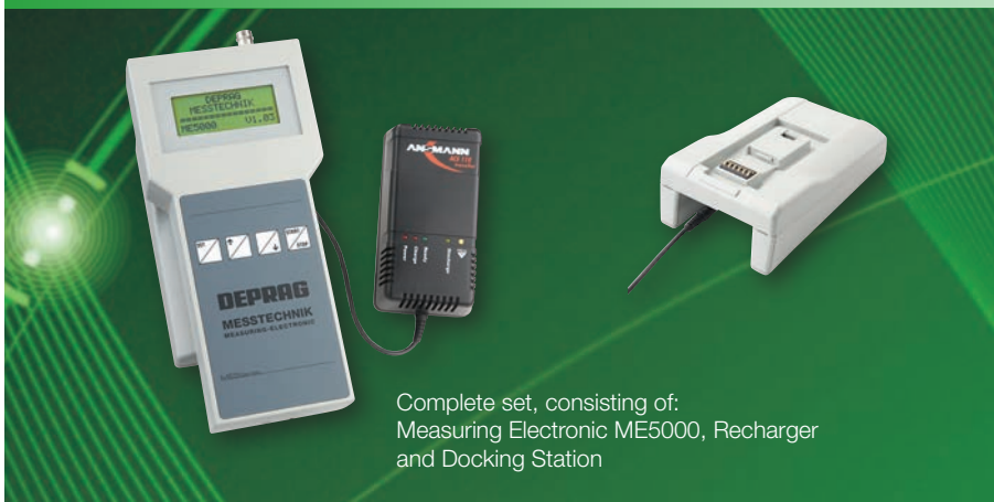
Complete set, consisting of: Measuring Electronic ME5000, Recharger and Docking Station