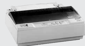
Printer ND 100