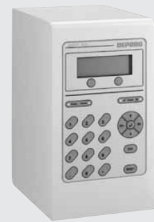
Sequence Controller AST 10-.