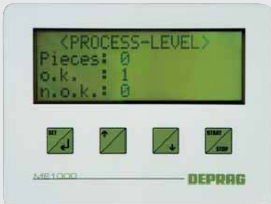
Process data version 1: Display of the status counter