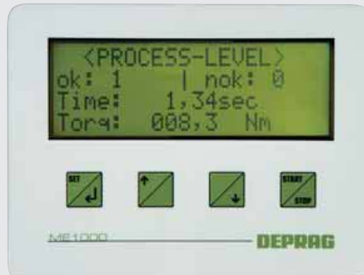
Process data version 2: Display of cycle time, torque and status counter